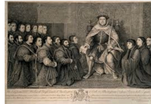
King Henry VII

King Henry VIII Religion: When the first Tudor king, Henry VII came to the throne England was a Catholic country. However, during the reign of the Tudor dynasty, there were two main religions in the country, as the reformation during the reign of Henry VIII